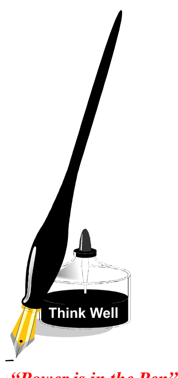
"Power is in the Pen"

Note: Be aware of the fact that anti-constitutional Judges and their colluding court officers, almost always create colorable 'Straw' conditions and arguments before the courts! These 'Straw' - personages and arguments, are oriented methodologies explicated by Colonial Dutch Masters, and used for institutionalizing forced servitude and slavery. The undisclosed "Strawman" was devised for constant and deceptive exploitation of the Natural People.